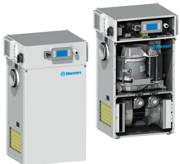
ML with Climatix Controls

ML Series dehumidifiers conform to both harmonised European Standards and to CE marking specifications.