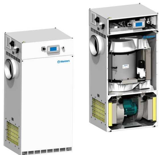
ML with Climatix Controls

ML Series dehumidifiers conform to both harmonised European Standards and to CE marking specifications.